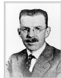
Franklin Carmichael 1890-1945

decision to destroy the property. The home was demolished on Monday evening because the builder would have lost the right to do so if he had waited for the official "Notice of intention to designate" which appeared in the paper the next day.