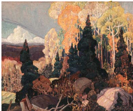
Autumn Hillside 1920 By Franklin Carmichael

On Thursday Feb 2 city council passed a motion to declare the home a historic property on the advice of the Toronto Preservation Board . However, this